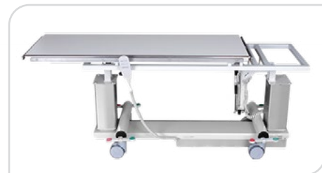
Special version with sliding top