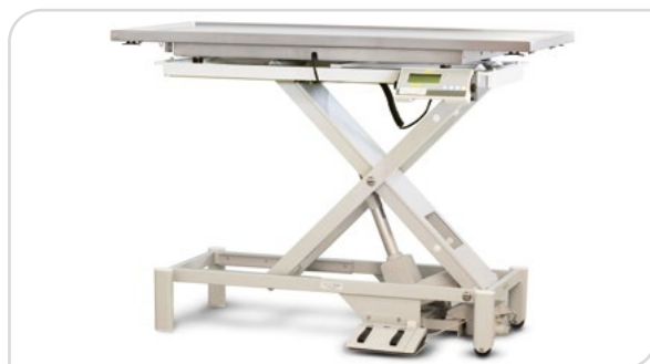
Special version with integrated scale