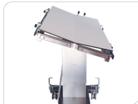
Lateral 20° electric tilt